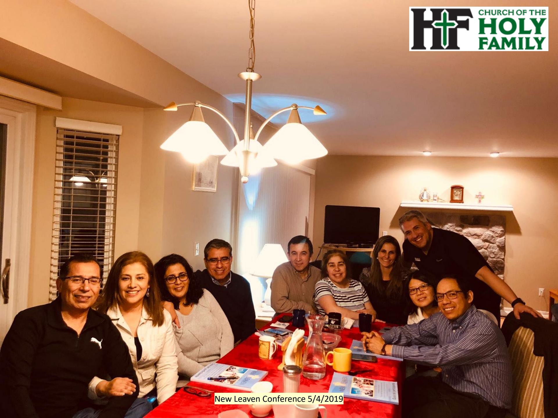
New Leaven Conference 5/4/2019