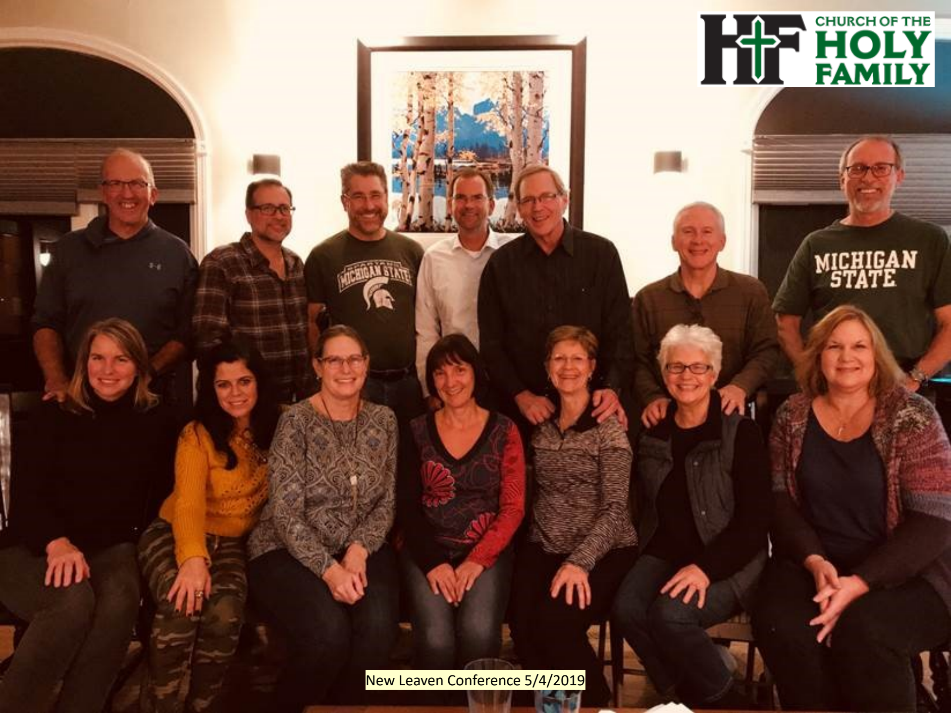
New Leaven Conference 5/4/2019